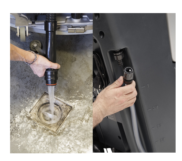
10. Once you have finished cleaning empty the recovery tank with the hose. Then empty the solution tank with the trasparent hose.