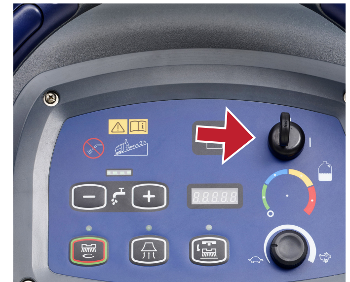
6. Lower the brush deck with the pedal. 7. Turn on the key, then slightly press the handle switch to engage the brush.