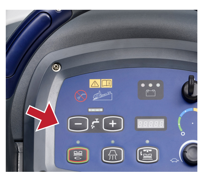
8. Adjust (if needed) the solution flow level according to the cleaning performance and application.