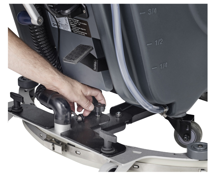
3. If the squeegee is not connected to the machine: install and fasten it with the handwheels, then connect to the suction hose.