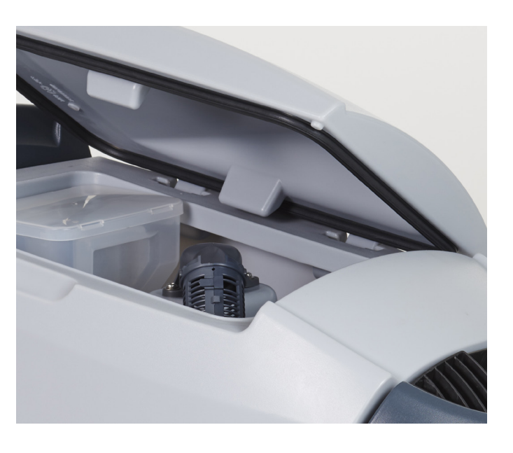
18. Park the machine with the recovery tank cover open.

If the machine has been used until the Red light illuminates on the battery level indicator on the machine, a full recharge of the batteries (10-12 hours) will be required. Failure to carry out this this procedure may cause damage to the batteries. Charging the batteries after every use is recommended.