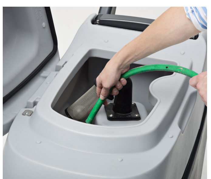
11. Wash with clean water the recovery tank and the vacuum grid.