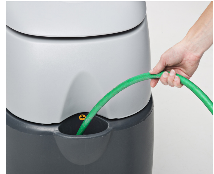
2. Fill the tank with a clean water. The clean water temperature must not exceed 40 °C.