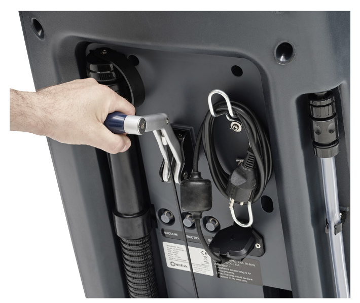
4. If the squeegee is in upper position, lower it with the lever.