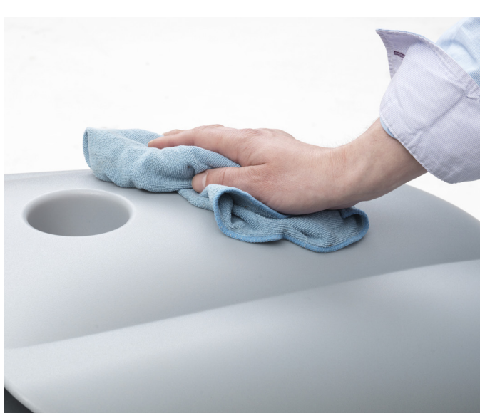
16. Clean the machine using a damp cloth and where needed use a neutral cleaning product.