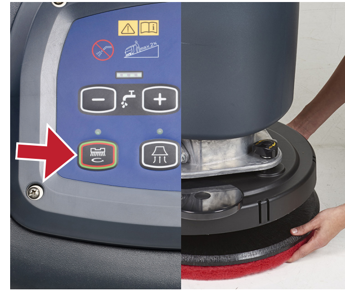
12. Press the click-off button and wait for the brush/pad holder to fall on the floor. Remove to clean or change brush.