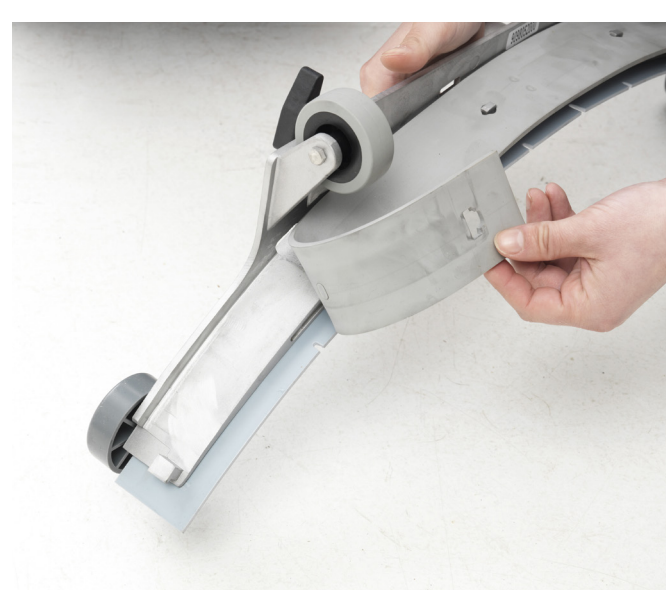
14. Check and clean the squeegee blades.