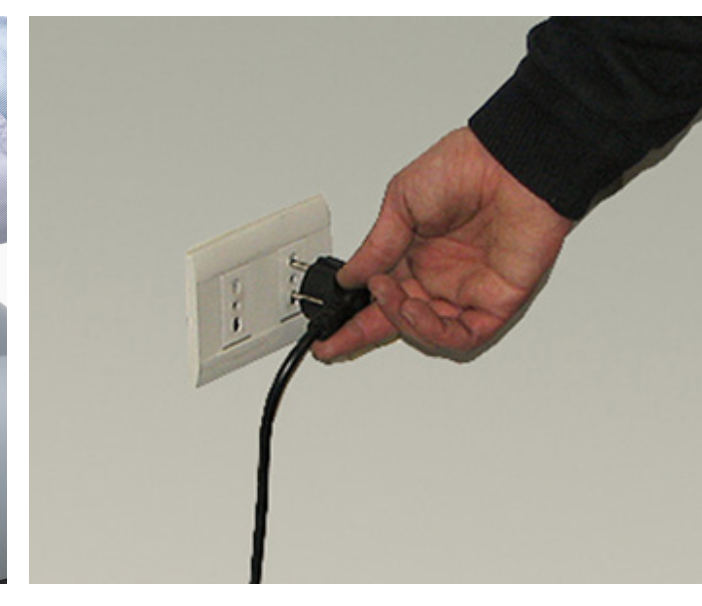
17. Charge the batteries: Connect the battery charger cable to the mains electricity supply..