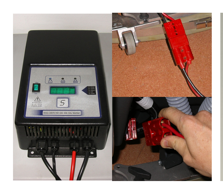
1a. Switch off charger by unplug charger cable from red battery plug. Reconnect the red battery plug to the machine.

ATTENTION! Do not use the machine before you have read and understood the Instructions for User Manual