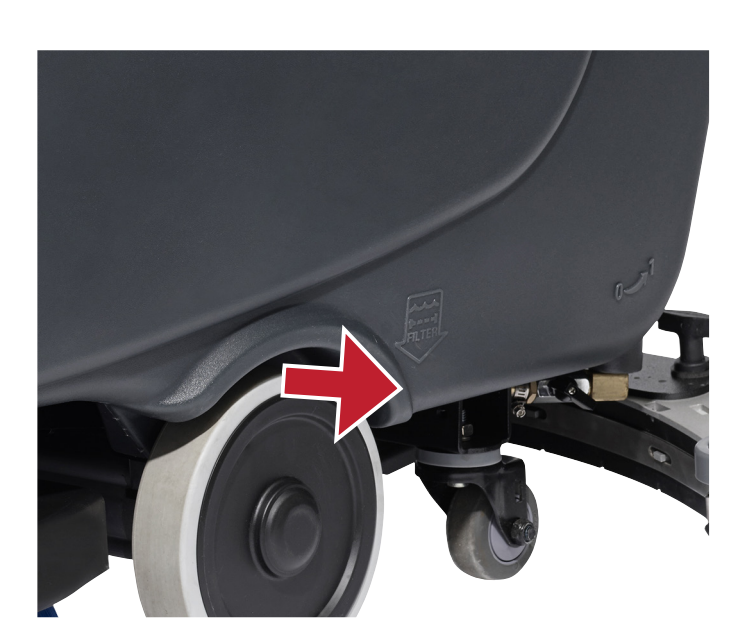
15. Clean the filter by removing the transparent cover and the gasket.