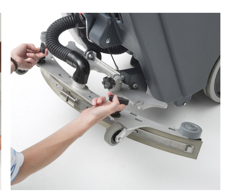
13. Take the squeegee off and remove debris.