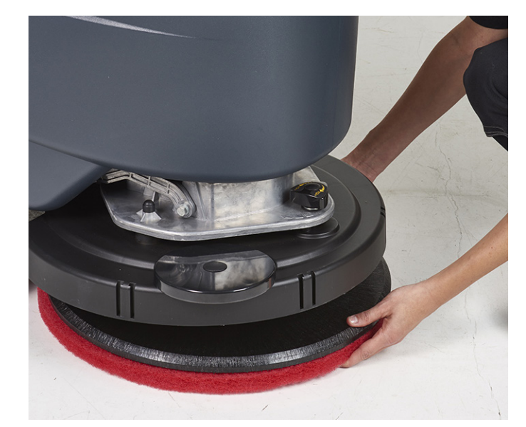
5. Place the brush or the pad-holder under the deck. Use the appropriate brush to clean the floor.