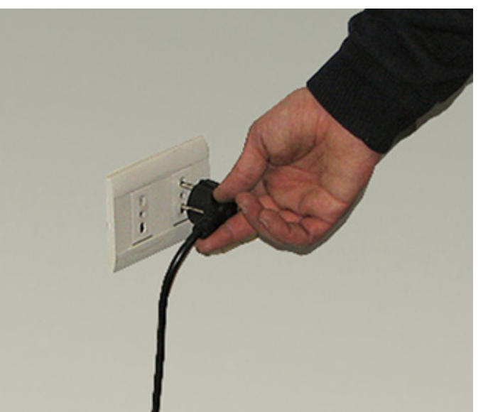
1b. Disconnect the battery charger cable from the mains electricity supply.